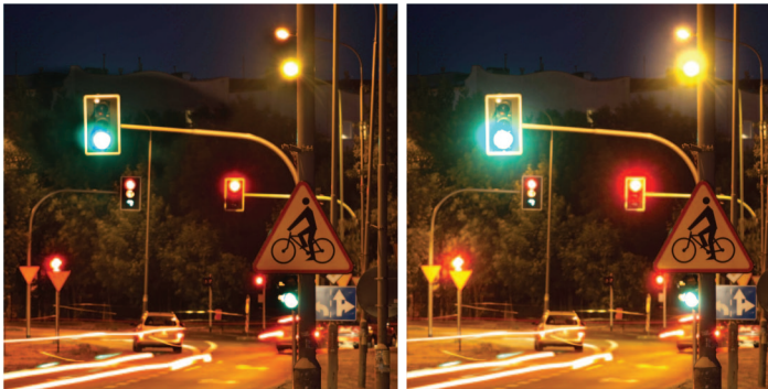
Customized All laser Lasik

Like your unique fingerprints, your eyes are truly one of a kind. Not only does Customized Lasik eliminate the need for glasses and contact lenses, it factors in the unique visual characteristics of your eye with the “Wavefront” technology to measure your eye and its irregularities.